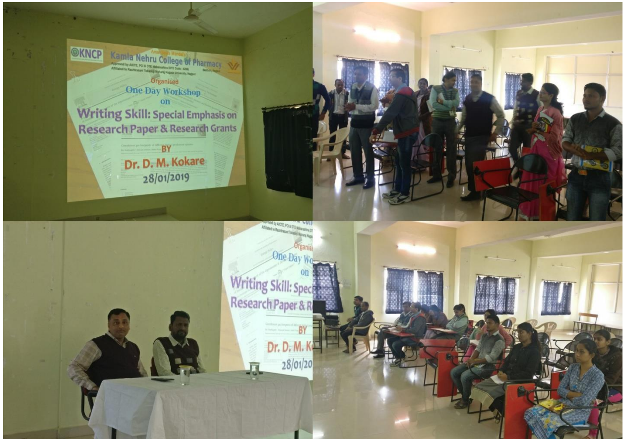
Photo: Writing Skill: Special Emphasis on Research Papers and Research Grants